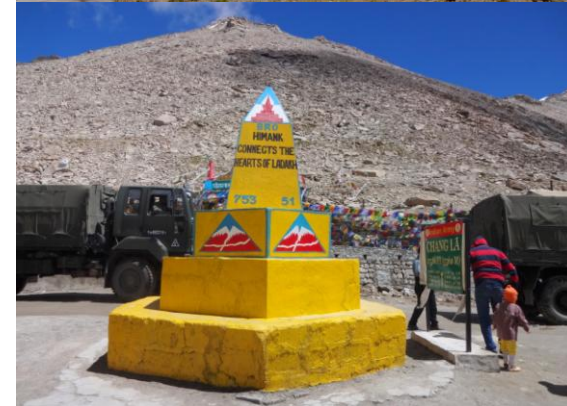
foreign tourists are permitted, is only some